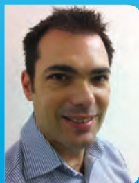
M.B.B.S (NSW) F.R.A.C.S (Ortho) Orthopaedic Surgeon