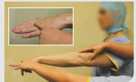
The Resisted extension test.