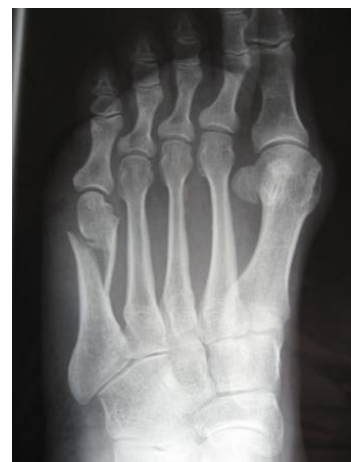
Figure 4: Distal shaft fracture

This fracture commonly occurs when the fifth toe gets caught on an object after a trip or a fall (figure 5). Although the x-rays can reveal fragments have separated, these fractures usually do not deform the 5 th toe, and are not noticeable from the outside. Non-operative treatment in a boot or a cast is the standard treatment. Walking on the foot can begin after two weeks.