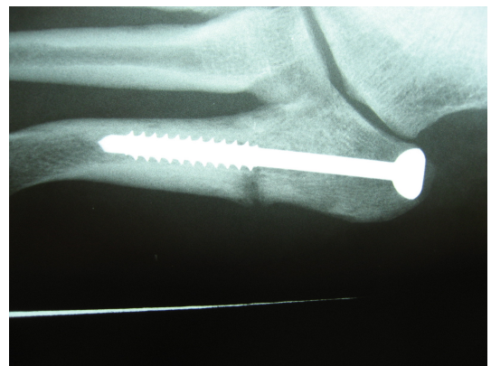
Figure 3: Fixation with Screw